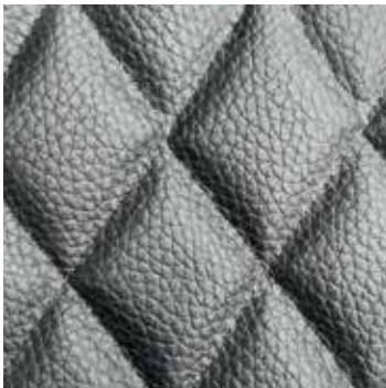
BLACK QUILTED LEATHER