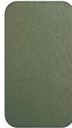
PEA GREEN TEXTURE