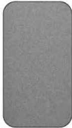
MOCK ROCK TEXTURE