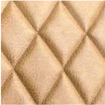
BROWN QUILTED LEATHER