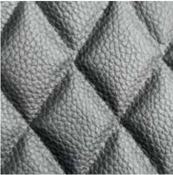
BLACK QUILTED LEATHER